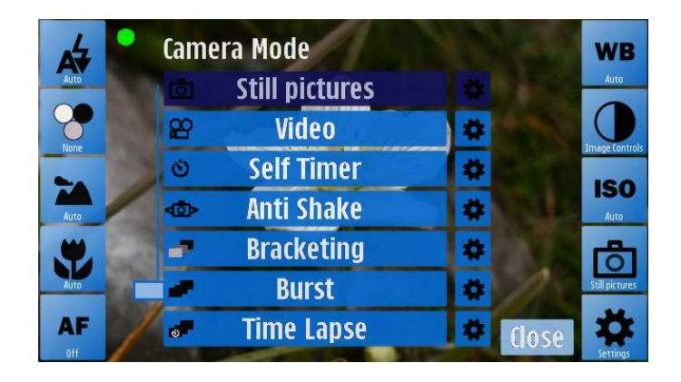
Figure 1 CameraPro user interface

One of the major goals of CameraPro is to provide fast access to camera features. The most important settings can be reached with two taps.